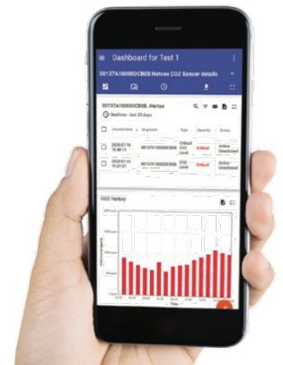
© Smart Box & GeoPortal - versión 2.0