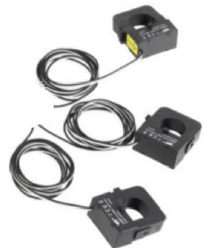
© Smart Box & GeoPortal - versión 2.0