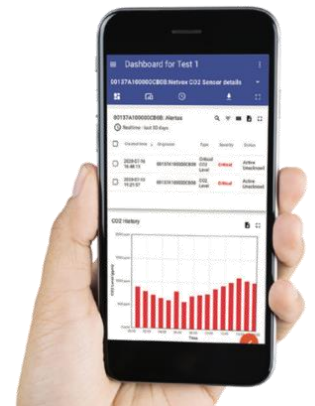
© Smart Box & GeoPortal - versión 2.0