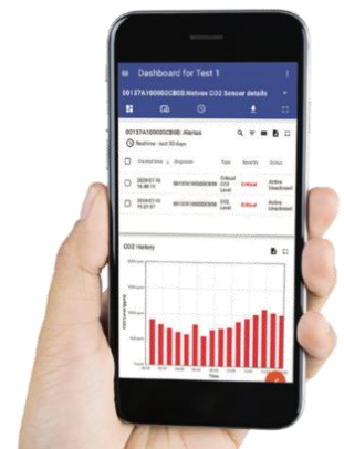
© Smart Box & GeoPortal - version 2.2